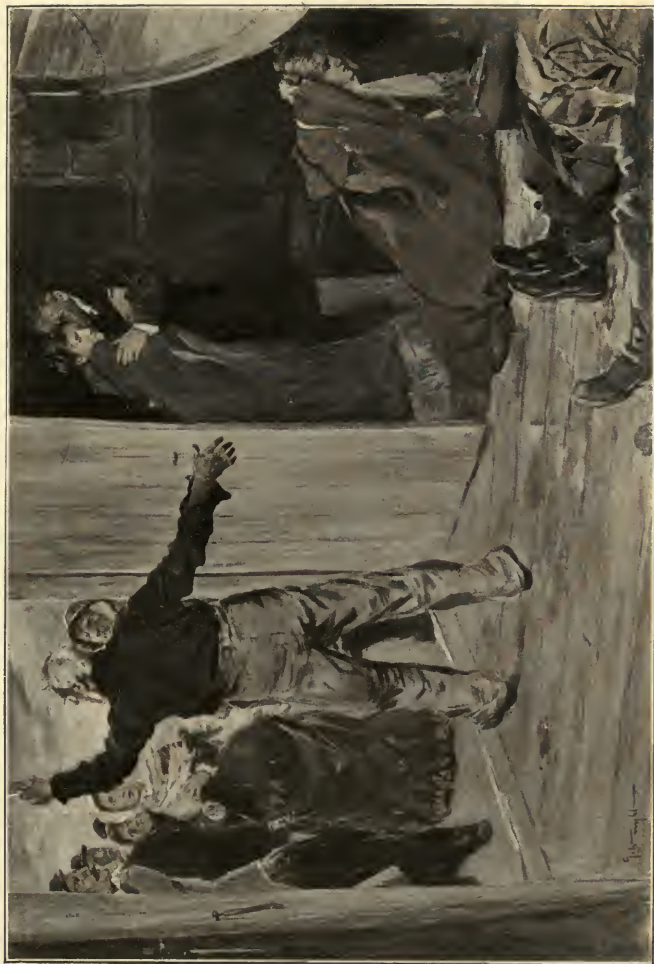
"Come in, men!" he shouted.